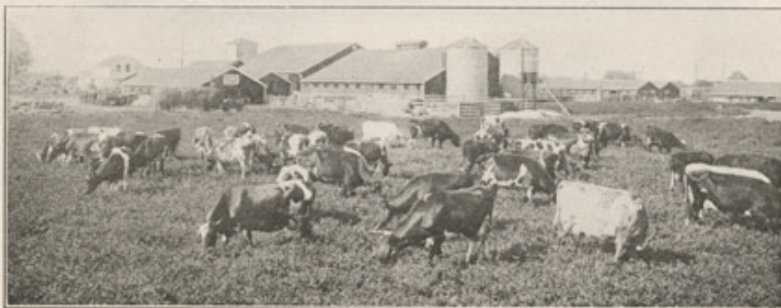
A MODEL DAIRY FARM IN THE SACRAMENTO VALLEY.