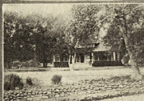
A TEHAMA COUNTY FARM HOME