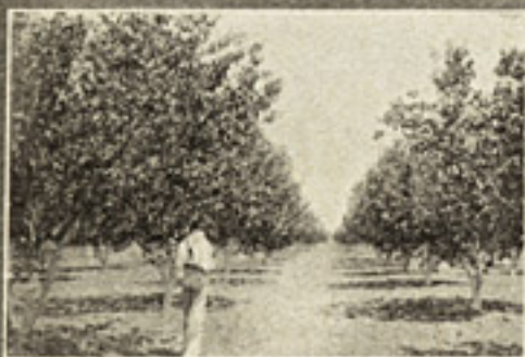
APRICOOT ORCHARD AT CORNING