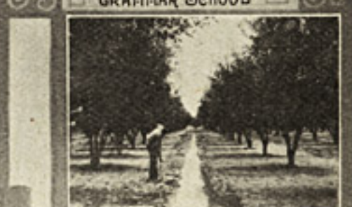
PRUNE ORCHARD KRAFT RANCH