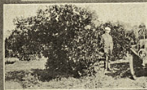
ORANGE ORCHARD AT CORNING