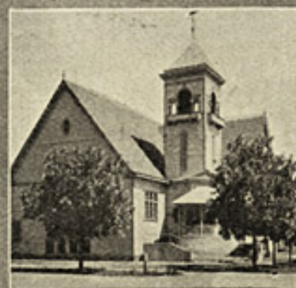
A RED BLUFF CHURCH

The source of life of the town is the county as a whole. The pursuits and products are numerous and varied. The mountains yield timber, which is sawn at Lyonsville and flumed forty miles to the Diamond Match Company's planing mill at Red Bluff. The plains and foothills are devoted largely to grazing sheep and cattle and to raising hay and grain. Fruit is a leading product of the county. The Bartlett pear orchard on the Cone ranch near Red Bluff is one of the largest in the State and has been declared by representatives of