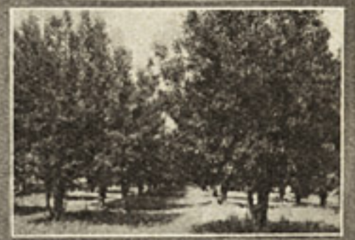
THE FINEST PEAR ORCHARD IN THE WORLD.