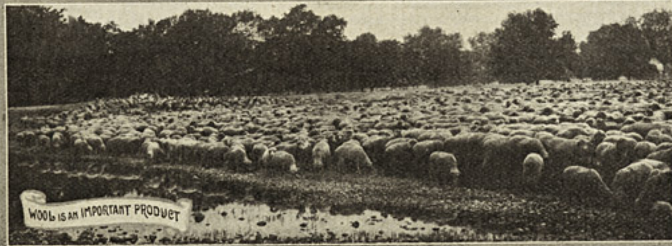
WOOL IS AN IMPORTANT PRODUCT