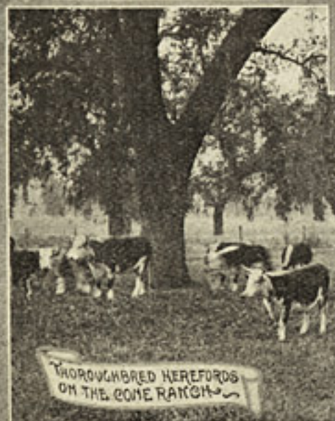
THOROUGHBRED HEREFORDS ON THE CONE RANCH