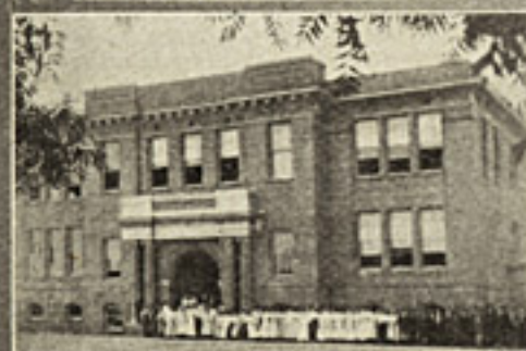
TEHAMA COUNTY HIGH SCHOOL