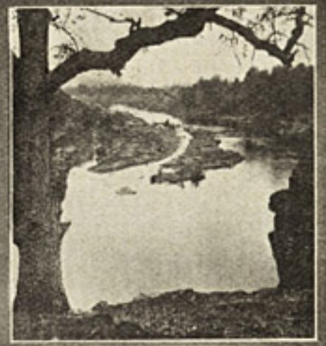
IRON CANYON Where a great dam is to be built by the U.S. Reclamation Service.

the United States Department of Agriculture to be the finest orchard in this country. This county produces more peaches than any other Sacramento Valley county.