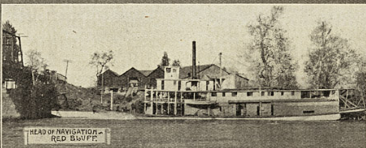
HEAD OF NAVIGATION RED BLUFF