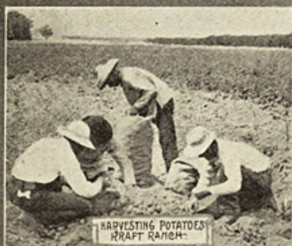
HARVESTING POTATOES KRAFT RANCH