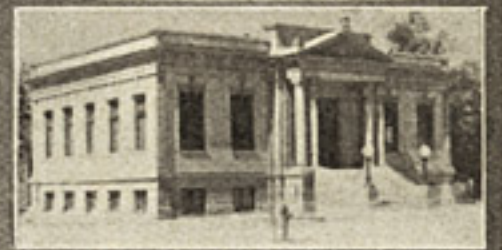
HERBERT KRAFT MEMORIAL LIBRARY

The average rainfall in Tehama County is nearly thirty inches, ample for all purposes were it distributed at proper intervals. As it is, the county has never had a failure of crops. With the wise distribution of water by irrigation, with the climate of the valley unsurpassed for the growth of plant life, there will be no end to the production of the county. Great ranches are being subdivided into farms and offered for sale. Some of the finest lands in this county with water ready for use are now being offered.