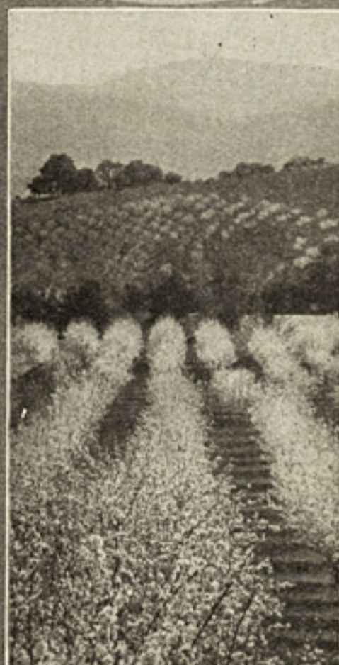
ORCHARDS COVER THE ROLLING HILLS