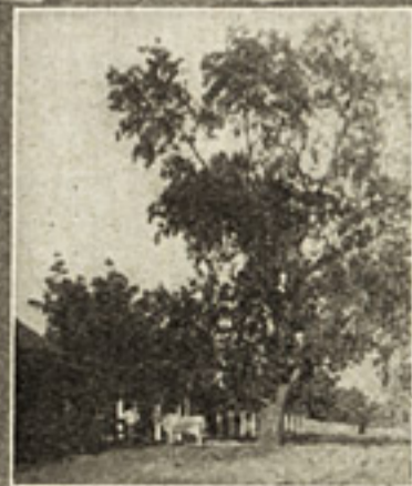
A FARM HOME NEAR LINCOLN