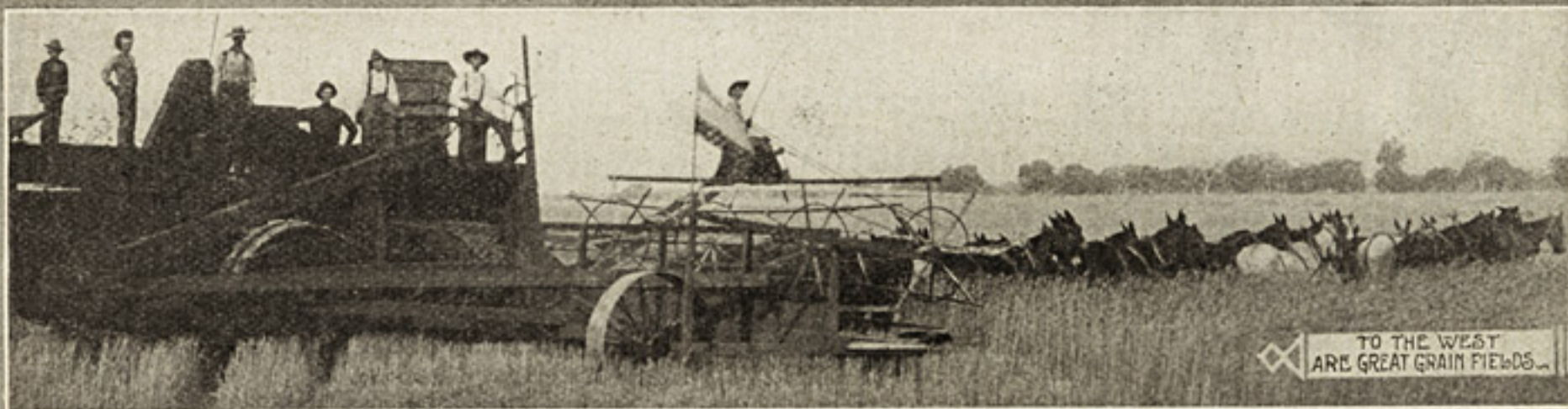
TO THE WEST ARE GREAT GRAIN FIELDS