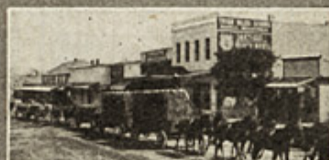
IN THE HAY SHIPPING SEASON

Lincoln is a busy and thrifty place. It is an important shipping center and the streets present a lively appearance during the marketing season. The Lincoln pottery is an important industry, not only to this place, but to the State. All kinds of terra cotta are manufactured, including facing brick, tiling, ornamental and architectural terra cotta. Six hundred men are employed. A second plant is being developed by a Sacramento company owning clay beds near town.