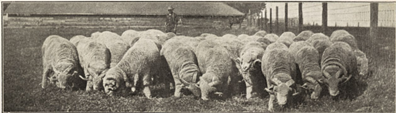
FLOCK OF THOROUGHbred RAMBOUILLET