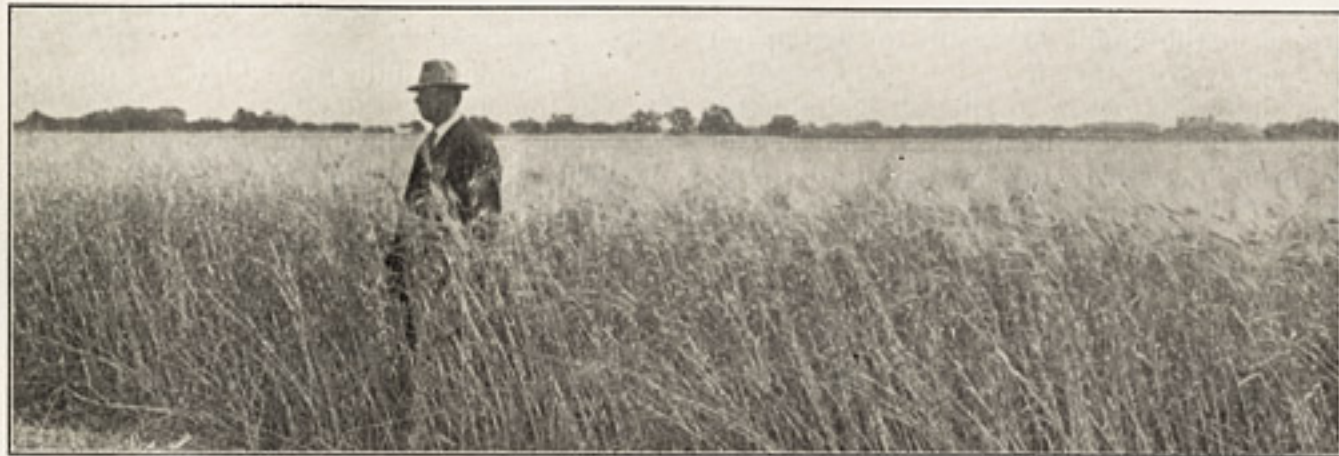
BARLEY FIELD, EIGHTY BUSHELS TO THE ACRE

The hog industry is very promising and is growing in importance. The standard breeds most in favor are the Berkshire, Poland China, Hampshire and Durocs. The Roselawn, Enterprise and Four Oaks stock farms have done splendid work in raising the standard and improving the breeds. A number of prize boars have been purchased of the most select breeders in Missouri, Iowa and Illinois. One breeder recently purchased an eight months' old boar, the sire of which sold for $5000. Another has on his farm the progeny of a prize boar that also sold for $5000.