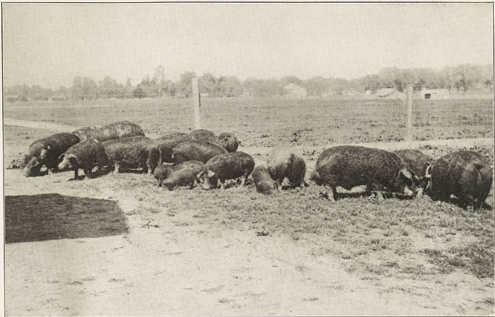
A BUNCH OF YOLO COUNTY MORTGAGE RAISERS