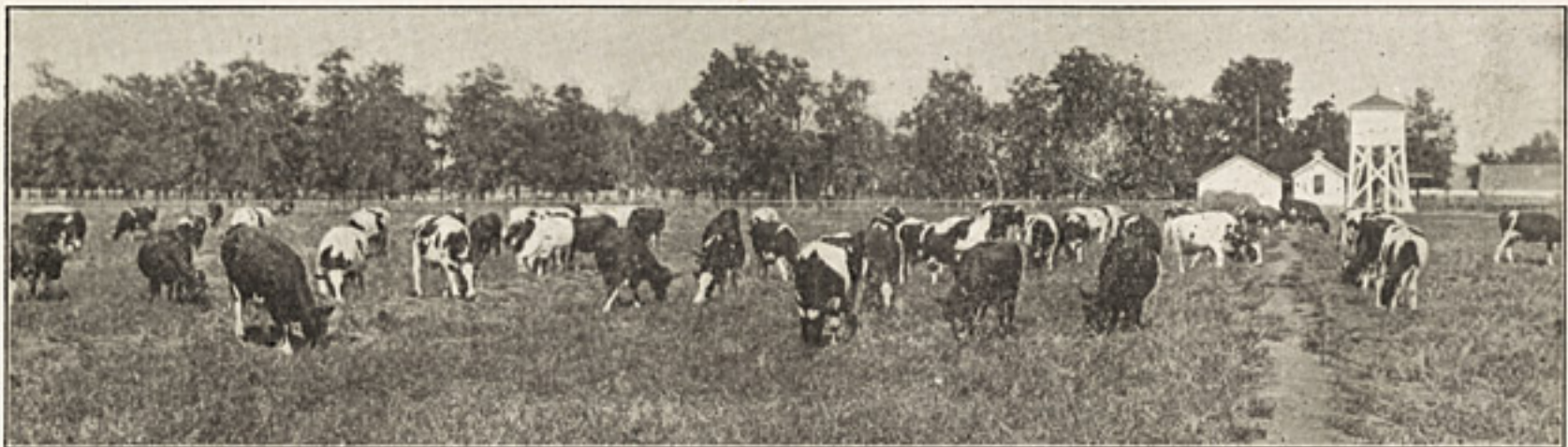
A YOLO COUNTY DAIRY HERD