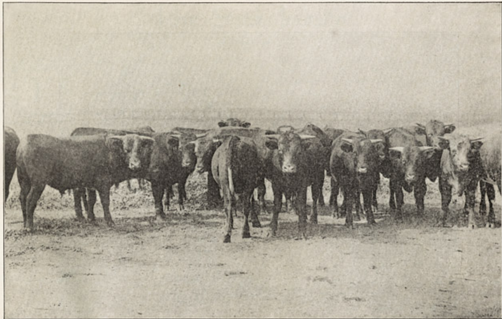
A GROUP OF YOLO COUNTY SHORTHORN BULLS