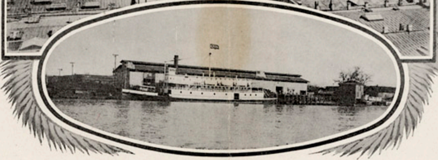
COMPANY'S LANDING SACRAMENTO, THE CAPITAL CITY

RESERVE STATEROOM ACCOMMODATIONS BY TELEPHONE