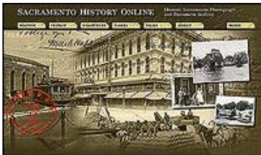
Screen 1. Main Menu

The images below provide screen print examples of keyword searches, a restricted search, search results, and an individual entry.