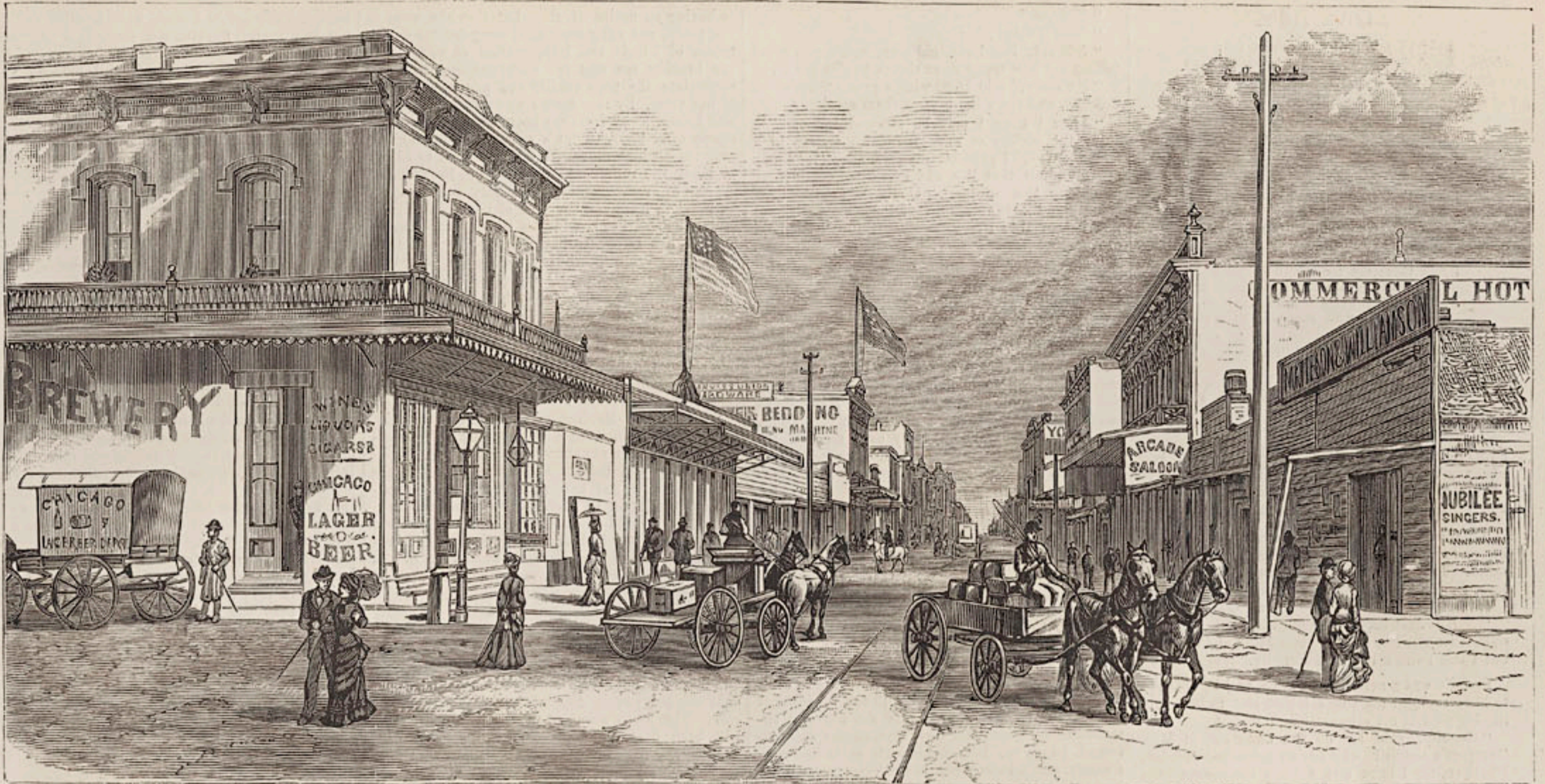
A STREET SCENE IN SACRAMENTO.