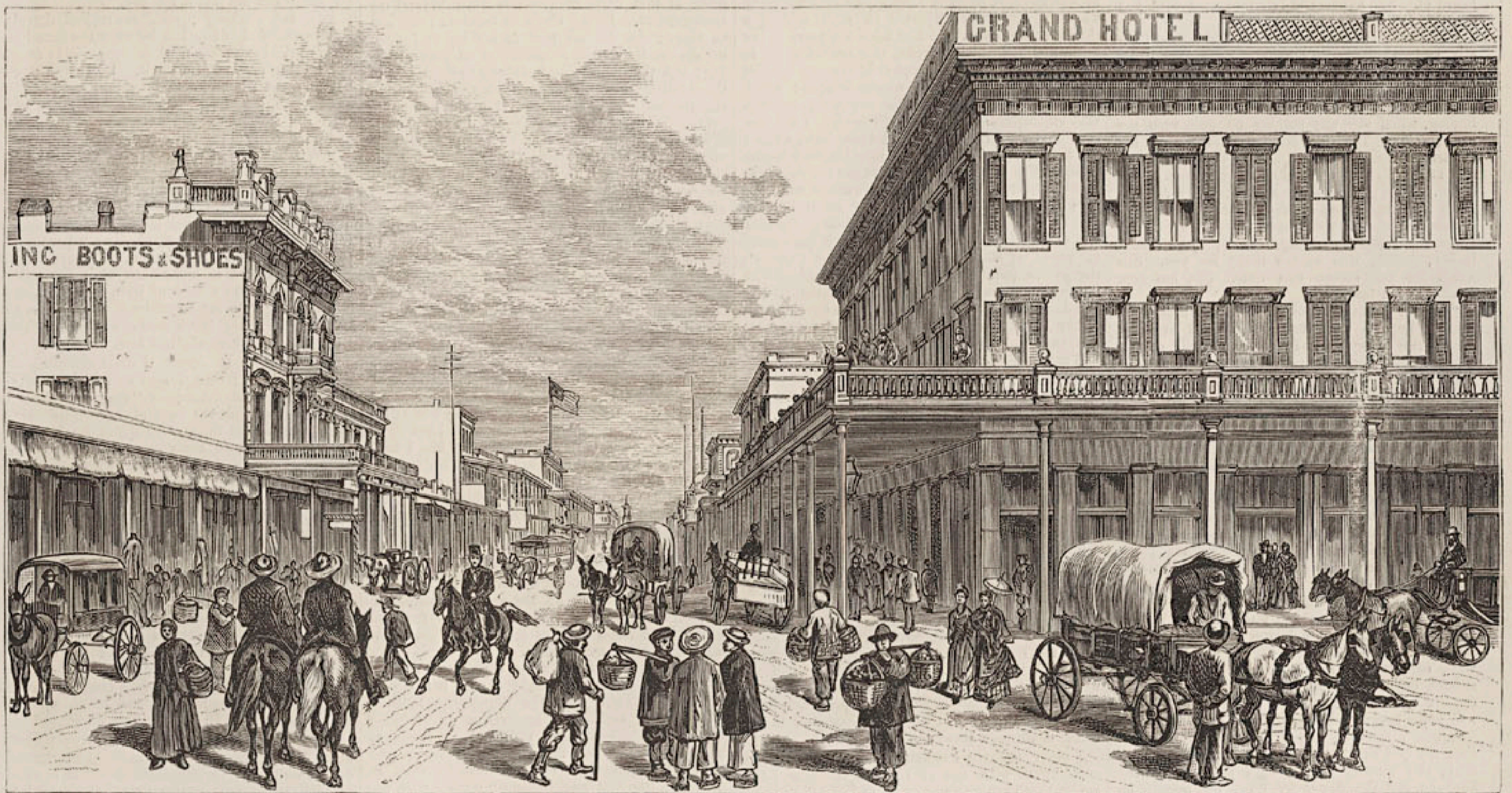
THE GRAND HOTEL IN SACRAMENTO CITY.