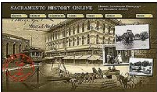
Screen 1. Main Menu

The images below provide screen print examples of keyword searches, a restricted search, search results, and an individual entry.