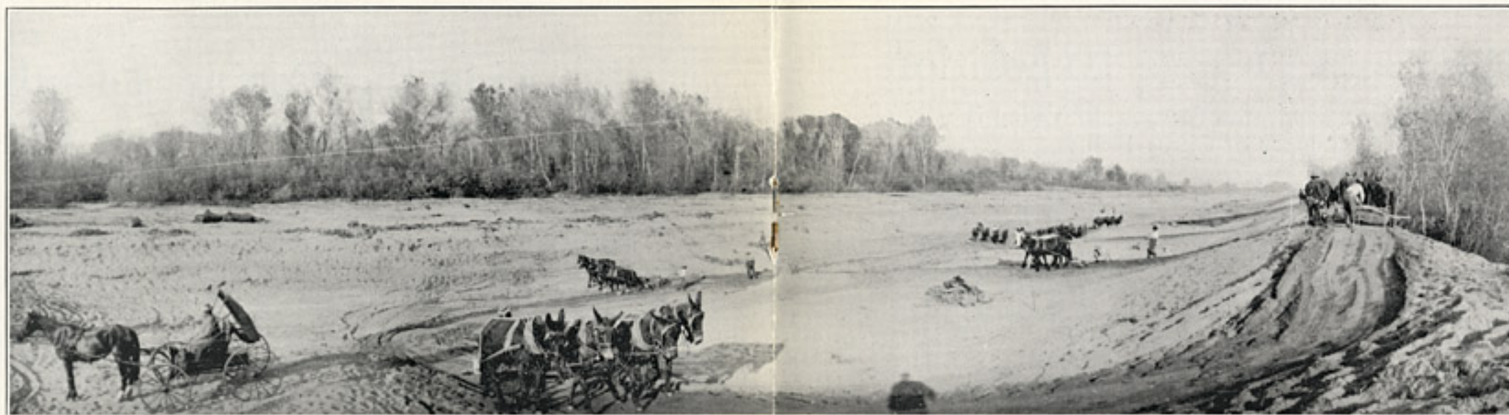
1 Work on the Bear River Completed Before Christmas. The Photograph Was Taken Above the Drag Line Excavators and Shows Only a Small Portion of the Force Employed.

The photographs are presented in the order that the work is being undertaken, starting from the foothills to the Sacramento River.