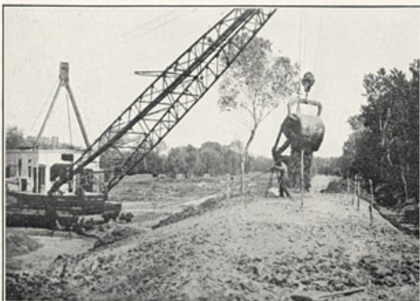
2 Drag Line Excavator Building Up the Levee.

The photographs are presented in the order that the work is being undertaken, starting from the foothills to the Sacramento River.