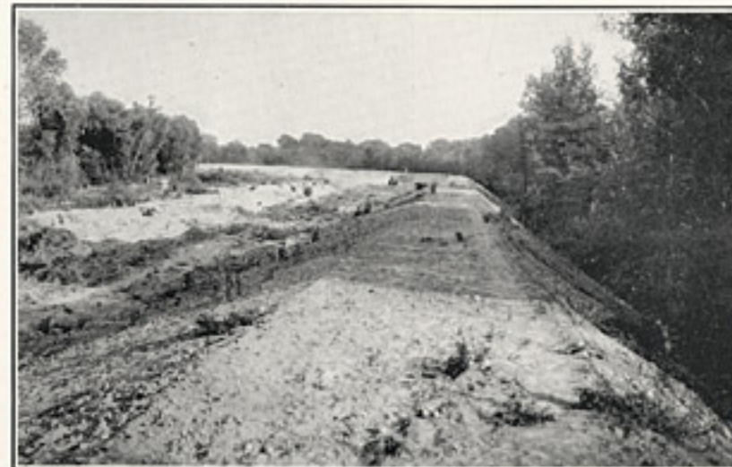
4 The Levee as It Looks Completed.