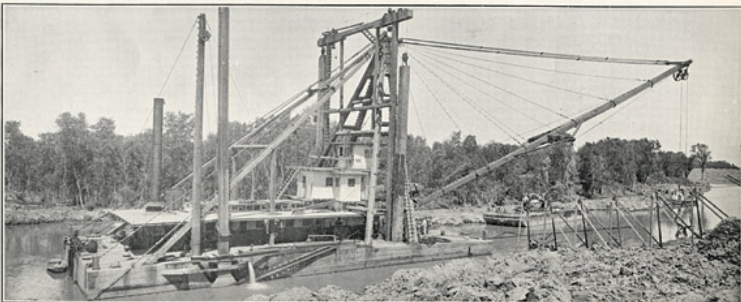
5 The Dredge "Thor" Above Nicolaus.