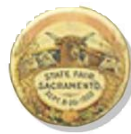
h. Additional images: railroad depot, exaggerated postcard, and State Fair button

5. There are several ways to visit the farm. You can explore different locations on your own to learn more about farm life or gather clues to solve a puzzle.