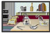
a. Farmhouse kitchen

4. In the game, children make an imaginary visit to their aunt and uncle’s farm in the Sacramento Valley. Although set in the early 1900s, the events and activities shown are typical for any family farm without electricity and refrigeration, from the 1880s through the 1920s. Featured areas on the farm include the following: